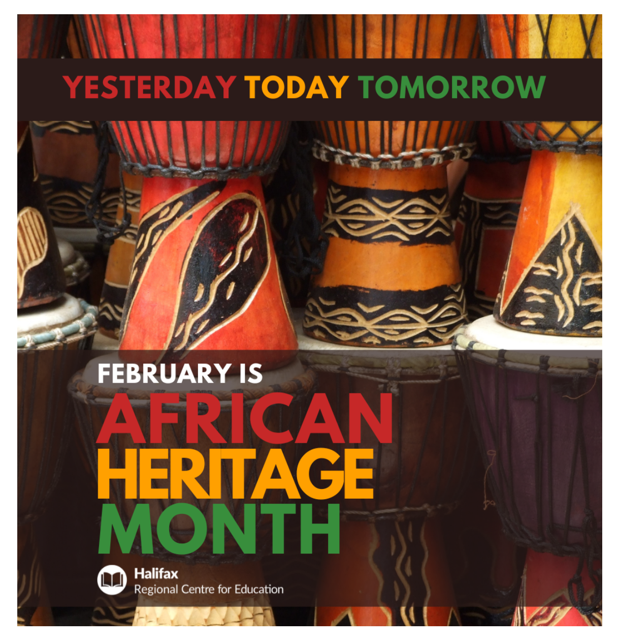
Celebrate African Heritage Month 2025

African Heritage Month in Nova Scotia, celebrated each February, honours the contributions of African Nova Scotians.